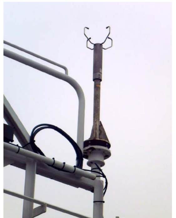
Figure 2. Ultrasonic anemometer on board R/V Polarstern. Similar instrument is installed on both sides of the ship and data is read from the sensor better exposed to wind.

The wind speed accelerates and direction changes when going around an obstacle. The impact of a central superstructure is especially large. The level of distortion depends on the direction of the wind relative to the ship, and it is minimum for wind blowing directly over the bow. The anemometer would ideally be exposed to air flow before it blows across decks and superstructures. A basic rule is to place the anemometer as far forward and as high as possible. Foremast is a good solution for meteorological instruments, but not always applicable. Also, it would be good to have one sensor in both sides of the ship or of the mast, so that the data can be taken from the side more freely exposed. In the surface layer (lowest part of atmospheric boundary layer) where the wind measurements are conducted, the wind speed has a strong vertical gradient. Therefore, it is important to know and report the exact instrument height so that the correction for effective height can be done.