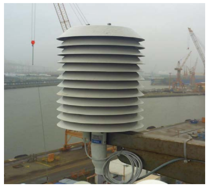
Figure 1. Temperature and humidity sensor (PRT), protected from solar radiation, on board R/V Polarstern. Similar instrument is installed on both sides of the ship. For analyses, data of windward sensor is used.

sensor should be placed as far as possible form any heat source from the ship and protected from direct sun light. Some type of enclosure is a typical solution for shading (Figure 1). The enclosed system requires ventilation. Natural ventilation is usually enough in windy and cloudy conditions, but in strong sunshine and calm wind the temperature in the enclosure can rise degrees above the true several temperature. Thus, a forced ventilation (fan) is recommended. In optimal case, there is a sensor in both sides of the vessel and the recording can be taken from the side better exposed to the wind.