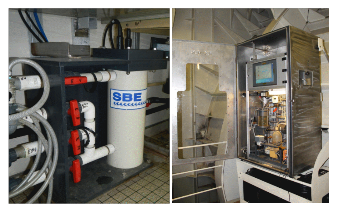
Figure 4. Thermosalinograph (on left) measures both SST and SSS. FerryBox (on right) is a flow-though system with multiple sensors for automatic measurements of serveral physical, chemical and biological variables.

For flux studies, skin temperature is of interest. Infrared radiometers get closest to the measurement of the interface: they measure the temperature at few micrometers depth. They have been reported to reach an accuracy of 0.1 °C. If this type of measurement is recorded, it must be clearly noted as skin temperature, and not as a SST observation.